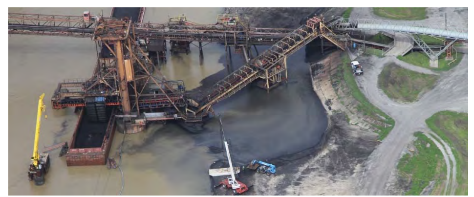
Discharges to the Mississippi River from the United Bulk coal terminal in Plaquemines Parish

Gulf Restoration Network, Louisiana Environmental Action Network, and Sierra Club v. United Bulk Terminals Davant, LLC, No. 14-608 (E.D. La, March 18, 2014) (Alleging that coal and petroleum coke discharges into the Mississippi River and failure to clean up and monitor spills violate the Clean Water Act) (157-045)