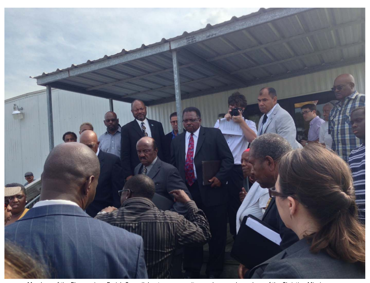
Members of the Plaquemines Parish Council, Ironton community members, and members of the Christian Missionary Baptist Ministers Association gather on the steps of the Plaquemines Parish Courthouse.

Court requires EPA to determine whether numeric nutrient standards are necessary to meet Clean Water Act requirements: On September 20, 2013, a district court granted the plaintiffs summary judgment in Gulf Restoration Network et al. v. Jackson, No. 12-cv-677 (E.D. La.) (2013 WL 5328547). The plaintiffs challenged EPA's denial of a petition for rulemaking to establish numeric standards to abate water quality degradation, including the massive low-oxygen "dead zone" in the Gulf of Mexico. EPA had denied the petition without determining whether numeric standards were necessary. The court remanded the decision to EPA, requiring a response within 180 days. TELC was part of a legal team on this case led by the Natural Resources Defense Council.